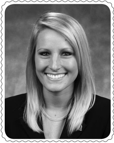
Palm Harbor, Florida