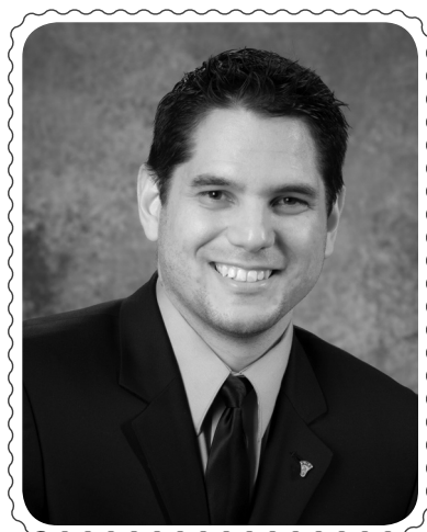
Ft. Lauderdale, Florida