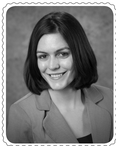
São Paulo, Brazil