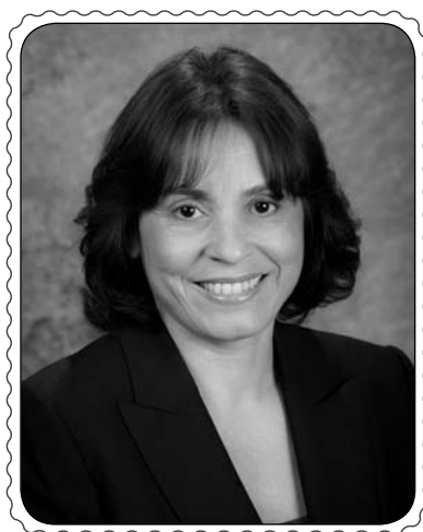
Winter Springs, Florida