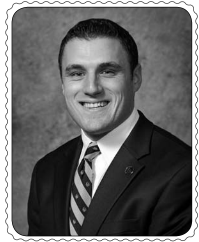
Smithtown, New York