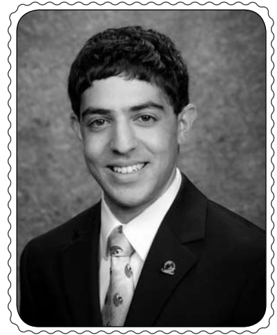
West Richland, Washington