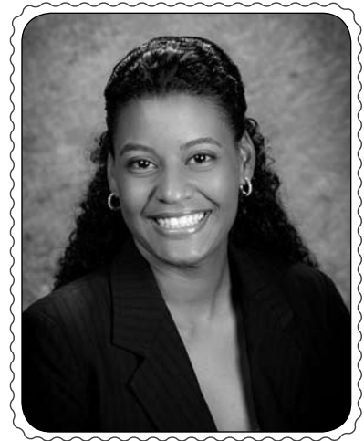
New York, New York