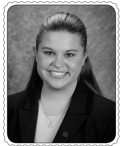
Coral Springs, Florida