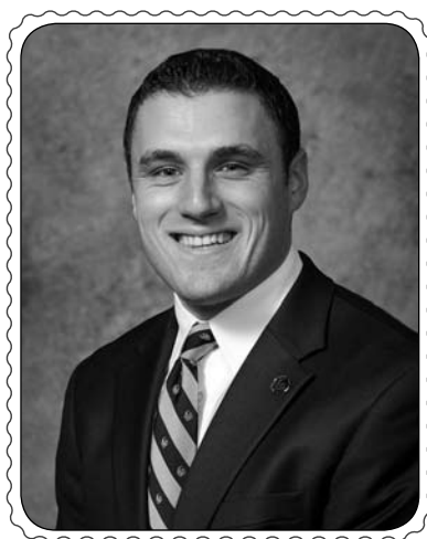
Smithtown, New York