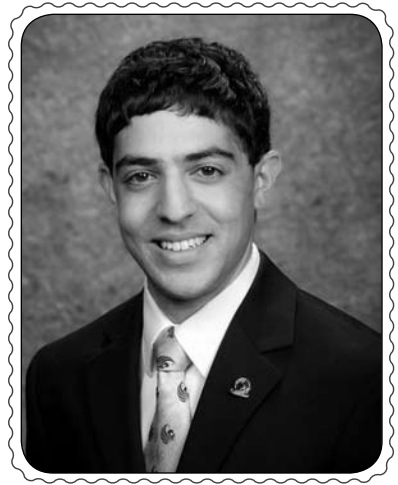
West Richland, Washington