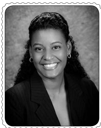
New York, New York