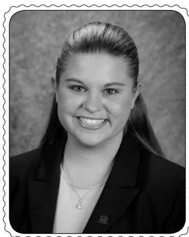
Coral Springs, Florida